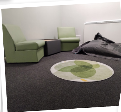
A safe space