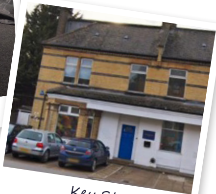
Key Stage 3 Site

Co-regulation rooms are safe spaces where students can self-regulate and work through their emotions and challenges.