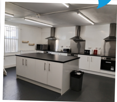
Our new kitchen