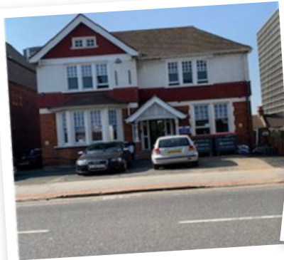
Key Stage 4 Site