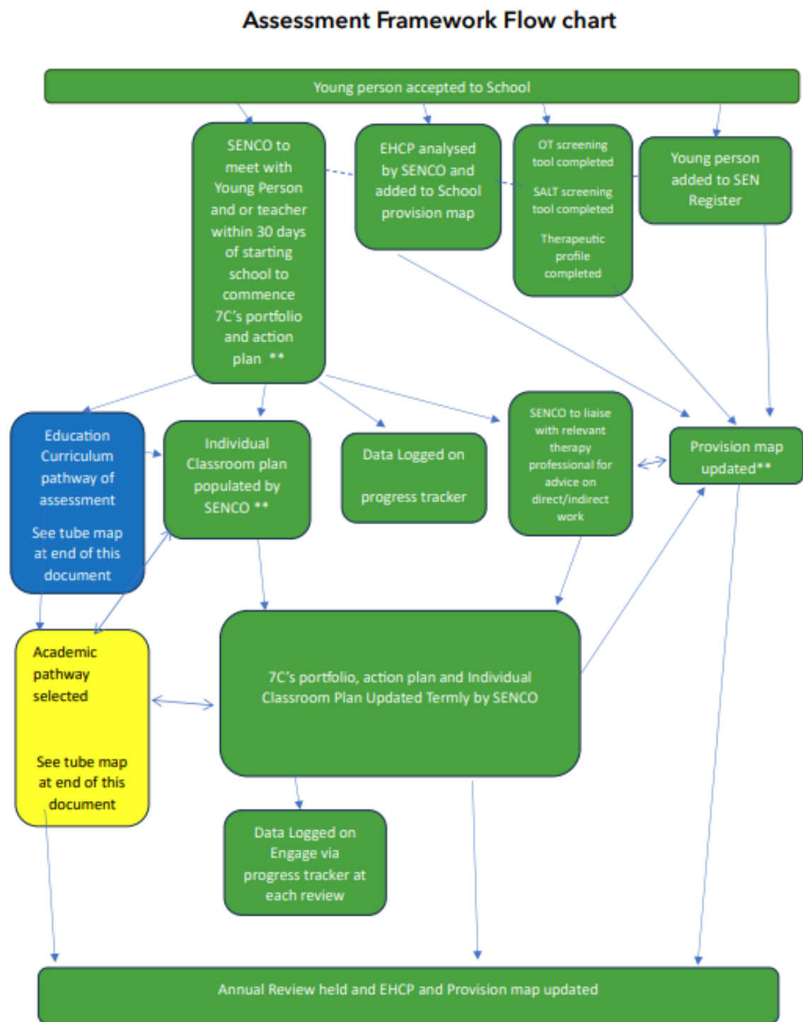
Figure 1 – Assessment Framework Flow Chart

** Provision map and Action plan then tailor ICP or prompt support from professional. i.e. areas to develop in coordination may prompt OT sensory assessment